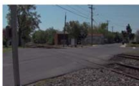
Search for Streicher – Tuesday, May 5, 2015