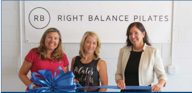
Right Balance Pilates