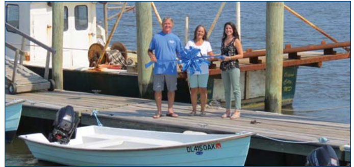
RP Boat Rentals

Community-Minded, Customer-Focused Since 1979