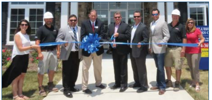
D.R. Horton Home Builder