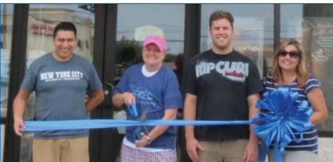
Twice Baked Coffee Bar