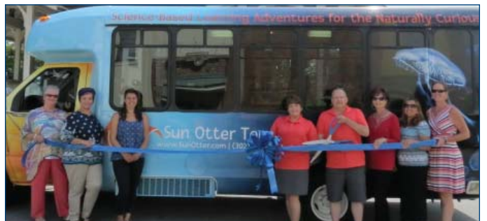
Sun Otter Tours