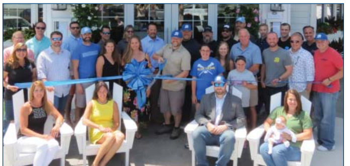
Bluecoast Seafood Grill & Raw Bar