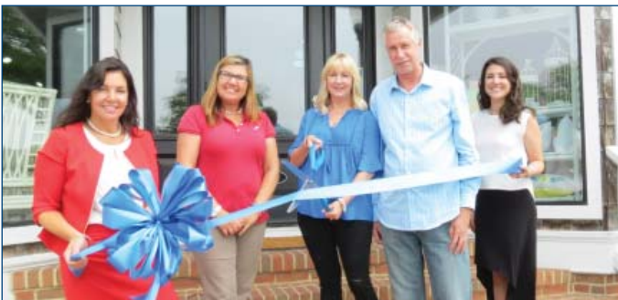
Best Nest Home Furnishings