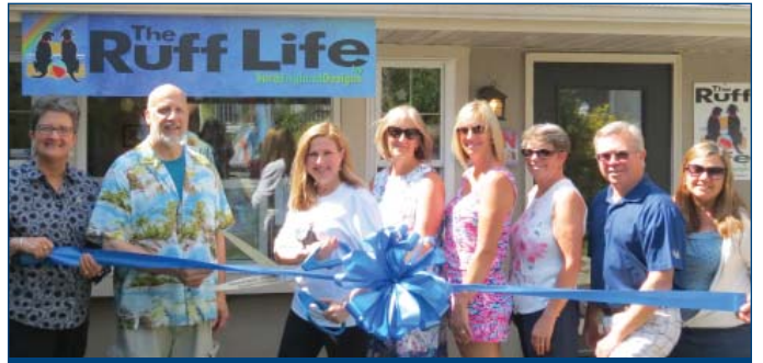
The Ruff Life