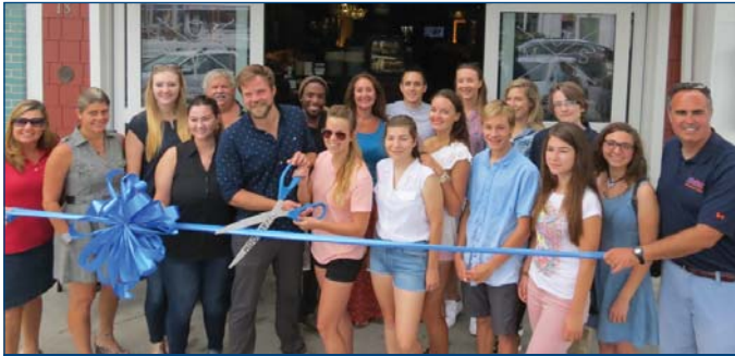
Mug & Spoon