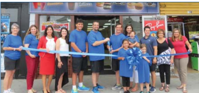
Makin' Whoopie Pies