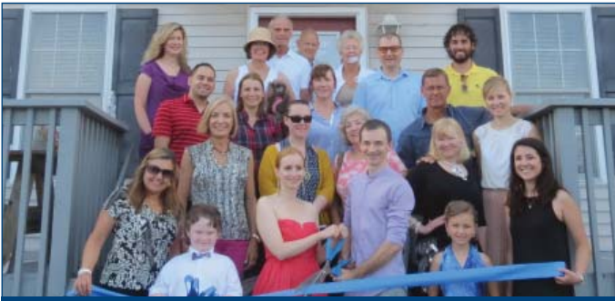
Rehoboth Massage & Alignment